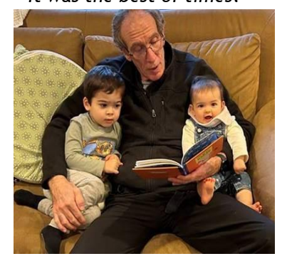
It was the best of times.