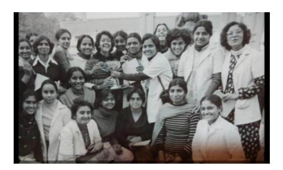
Lady Hardinge Medical School, New Delhi, India

Like Least: getting 'more seasoned' and having to keep up in technology with the younger students, residents and faculty which clearly does not come as easy for me compared to them.