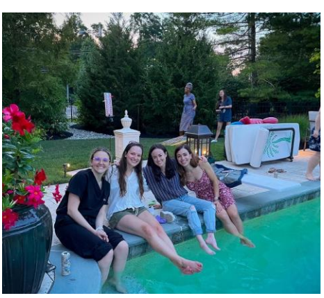
OB/GYN Team Player of the Quarter Voted by their peers