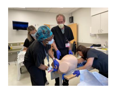
OB Society Resident Education Day