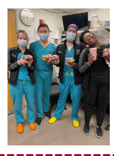
Wellness: it's what's for lunch!